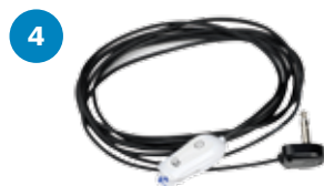
Automatic Activation Device AAD01