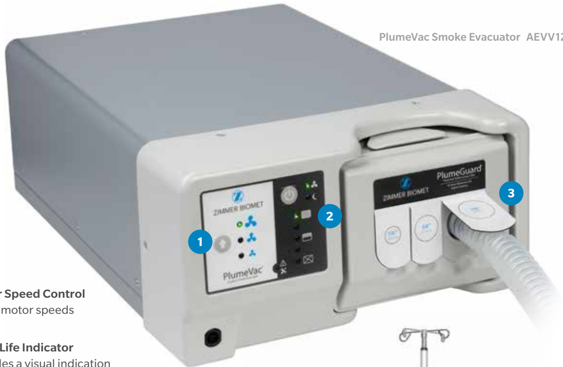
PlumeVac Smoke Evacuator AEVV120

The portable PlumeVac Smoke Evacuator gives you the flexibility to put smoke plume evacuation where you need it – on or off the cart.