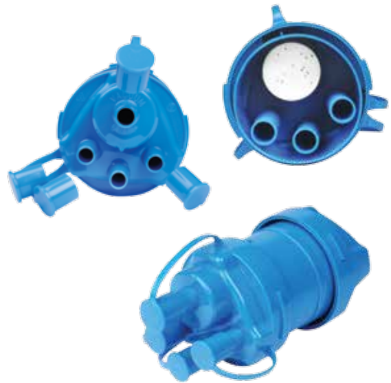
Single Use Manifold 00514020100