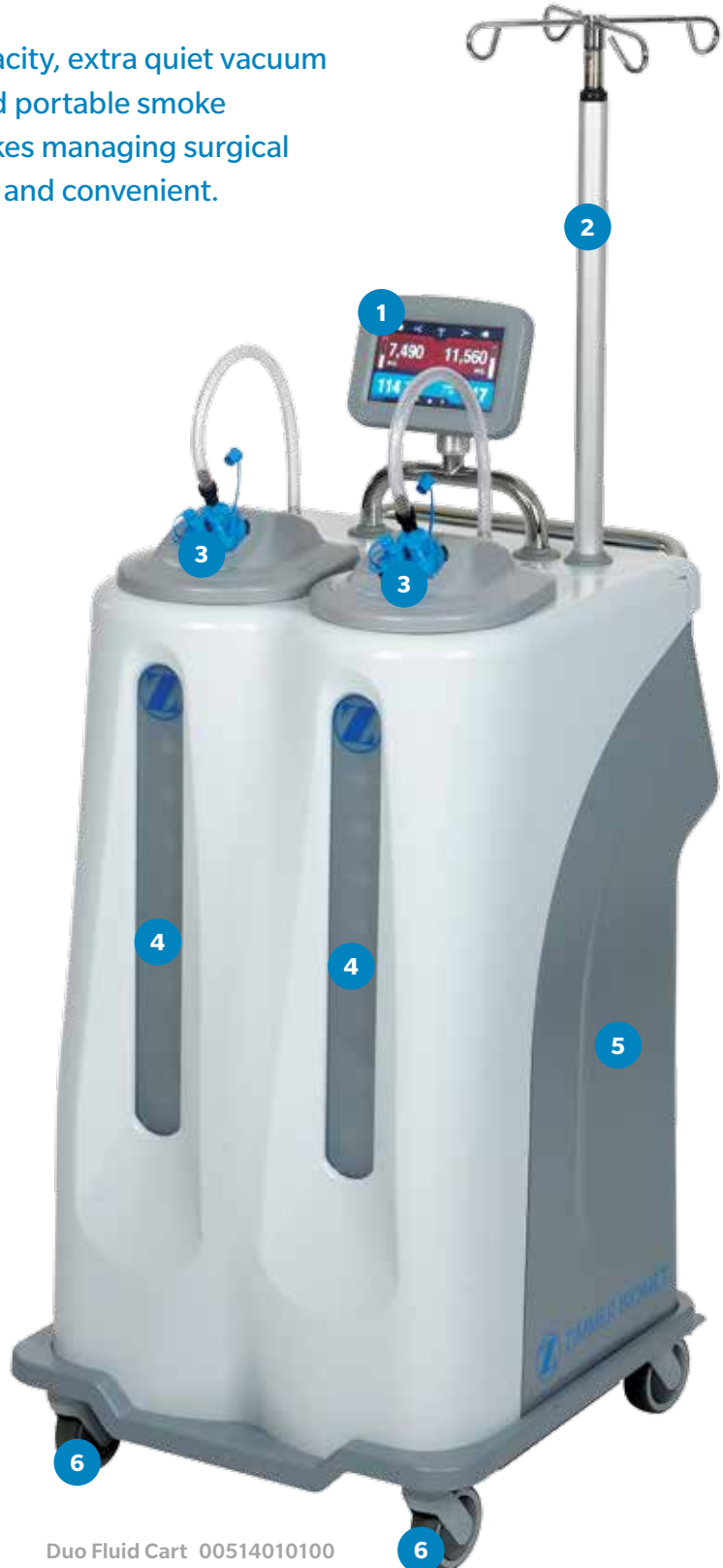
Duo Fluid Cart 00514010100