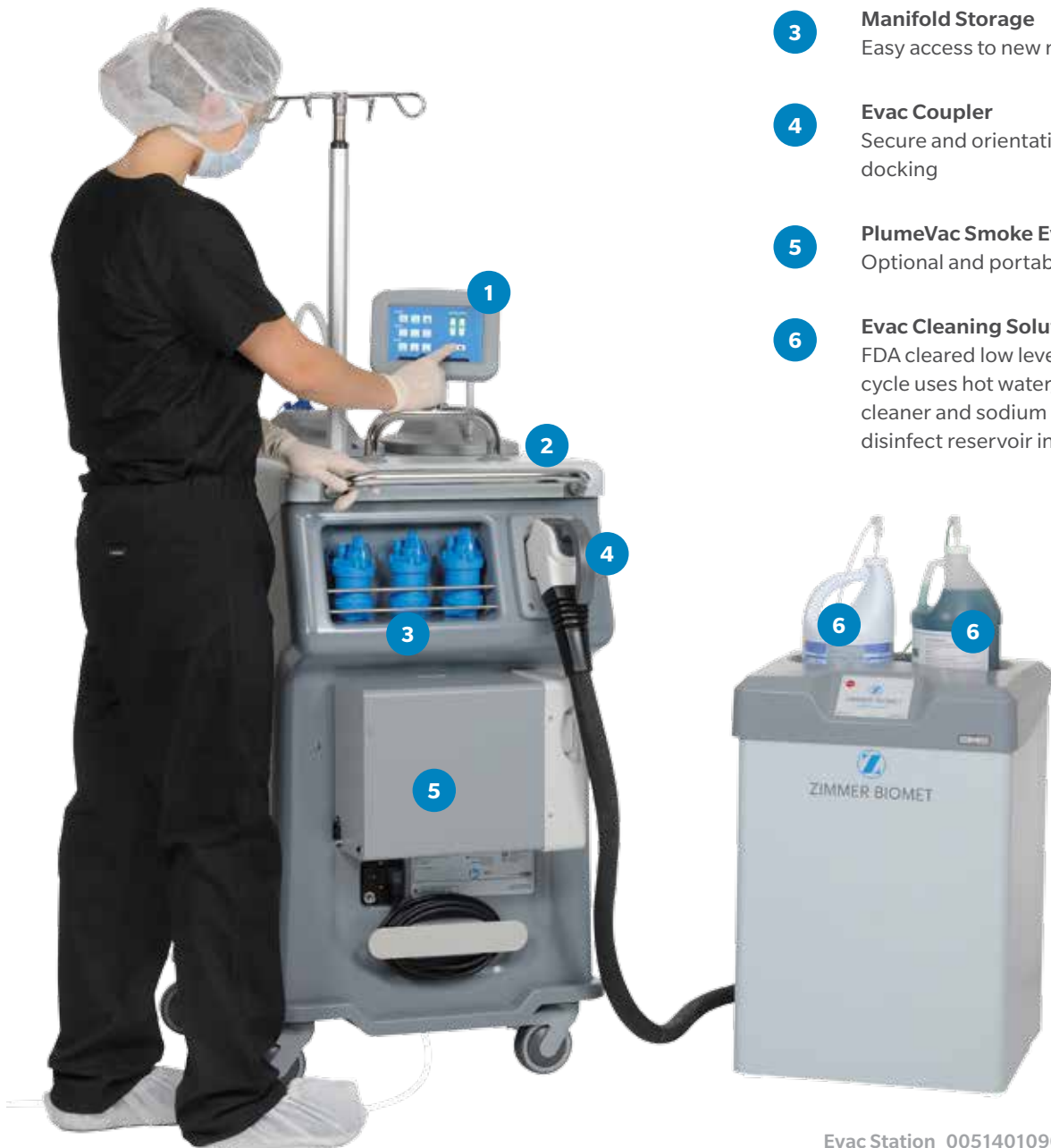
Duo Fluid Cart with Smoke Evacuation 00514010200