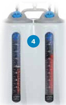
Reservoir windows with lights on/tint off